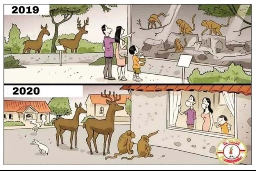
May 02/03, 2020 • Page 03

We have made some great friendships within our small community and we are both actively involved in the St Peters Pastoral Team.