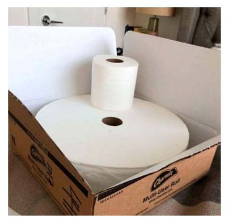
I got this big roll of toilet paper as a gag gift for Christmas. Who is laughing now!

For those without internet access, Sunday Mass is screened every week on Channel 10 at 6am.